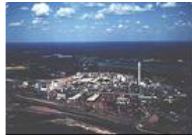
Smelting and Refining