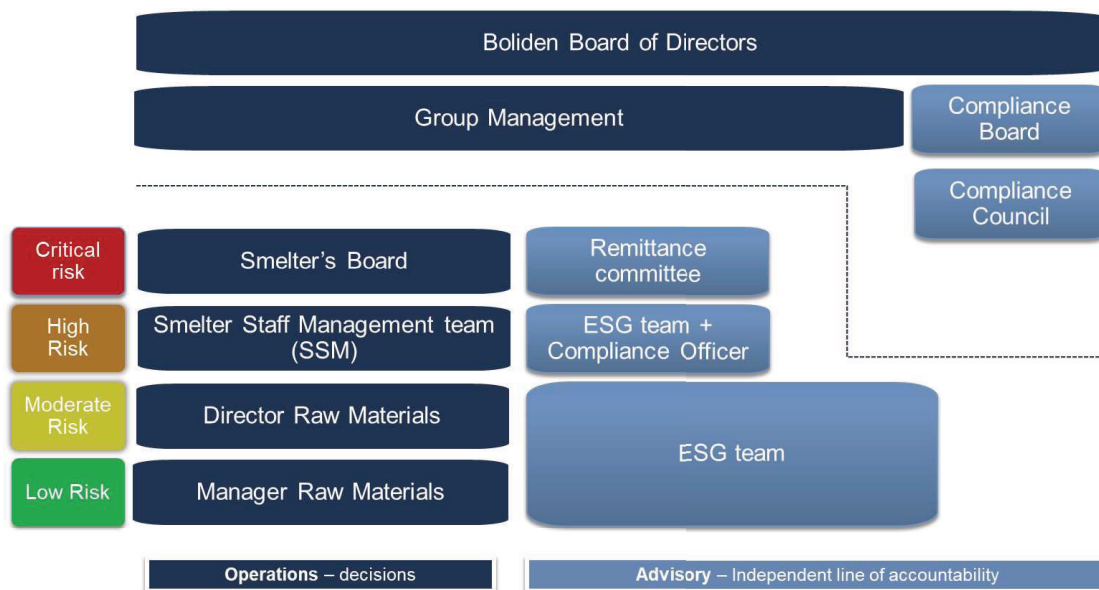
Figure 1. Governance structure of Boliden Smelters ESG program and process.

In Figure 1, the governance structure, including level of authorization and remittance, for cases subject to the ESG evaluation of business partner process, is visualized.