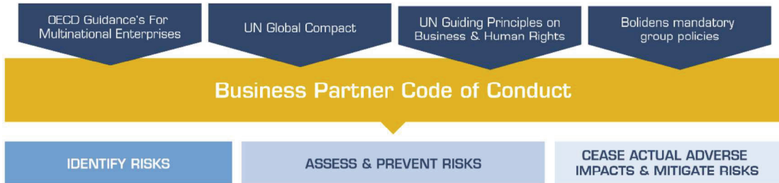
Figure 2. Boliden Smelters ESG process based on Boliden Business Partner Code of Conduct

contract clauses and acceptance of recommendations for improvement. This is followed by continuous monitoring, to ensure continuous development and actual improvement.