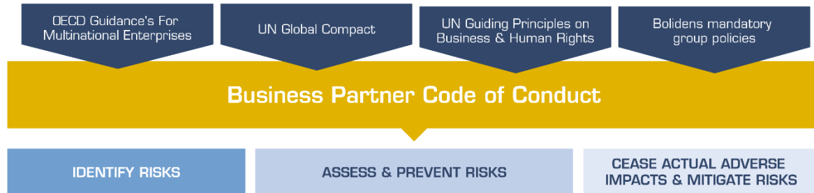
Figure 2. Boliden Smelters ESG process based on Boliden Business Partner Code of Conduct

monitoring, to ensure continuous development and actual improvement.