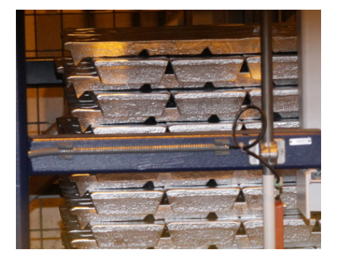
Standards: ISO 301, EN 1774 Grade: Norzak 5 ZL 0410, Norzak 3 ZL0400

By becoming Boliden's customer, we want to help you add value to your customers and work with you for a more sustainable future.