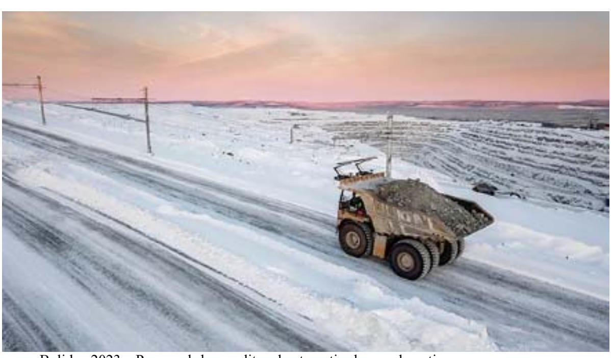
Boliden 2023 – Proposed share split and automatic share redemption

The tax implications for each shareholder depend on the shareholder's specific circumstances. Each shareholder should thus consult a tax adviser for information on the specific tax consequences that may arise in the individual case.