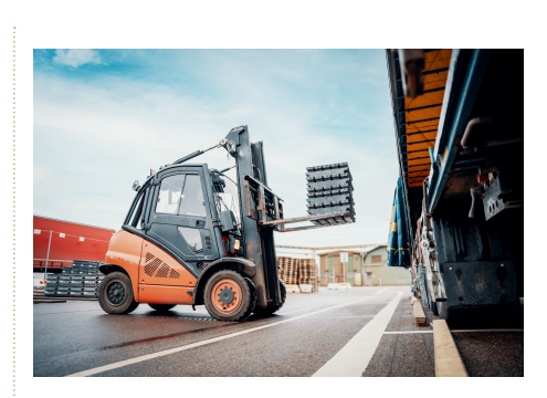
Brussels nomenclature 78011000

By becoming Boliden's partner, we want to help you add value to your customers and work with you for a more sustainable future.